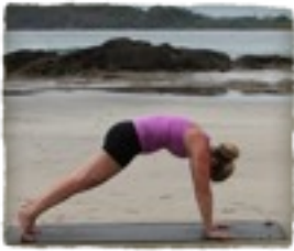
Wave down dogs