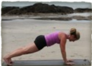
Hi Low Push Up to sparkle