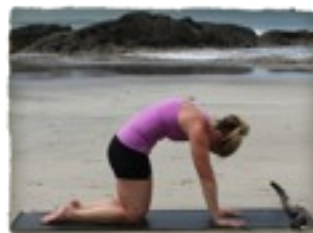
Cat Cow from Grace (knees)