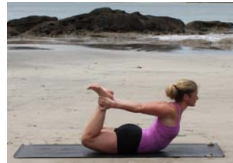
Bow & Locust (1/2 Moon & Side Plank Bow)