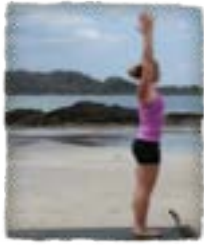
Shine & Spiral Twist