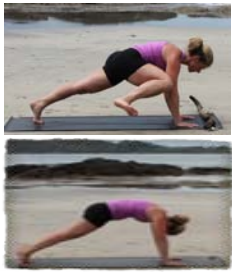
Plank Wave to One Leg D Dog