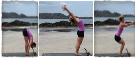
Forward Fold & Dive in!