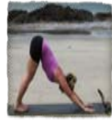
Connect D Dog